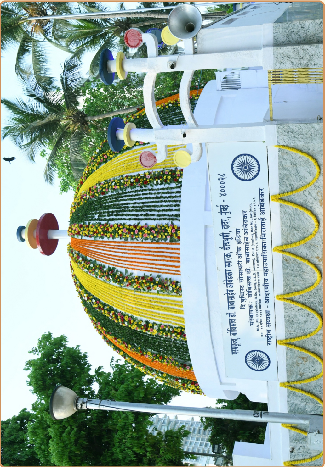
भारतरत्न डॉ. बाबासाहेब आंबेडकर यांचे स्मृतिस्थळ, चैत्यभूमी, दादर

Memorial of Bharat Ratna Dr. Babasaheb Ambedkar at Chaitiya Bhoomi, Dadar