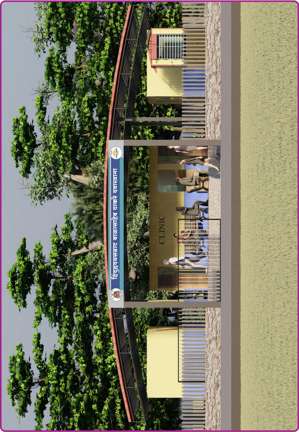
एकूण १४७ वैद्यकीय चाचण्या विनामूल्य करण्याची सोय असलेली 'हिंदुहृदयसम्राट बाळासाहेब ठाकरे आपला दवाखाना' योजना महानगरपालिकेतर्फे सुरु BMC has launched the 'Hinduhridayasamrat Balasaheb Thackeray Davakhana Initiative' having facility to conduct 147 medical tests free of cost